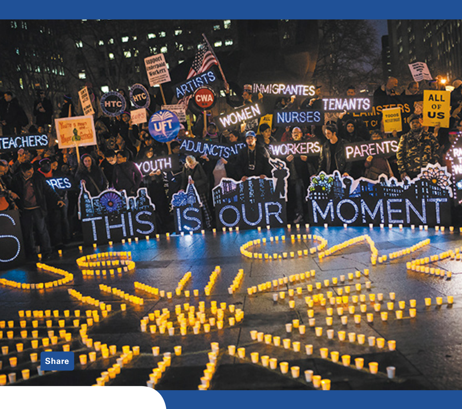
Image: Various unions, social causes and organizations attend a rally calling for greater social equality in New York, United States.